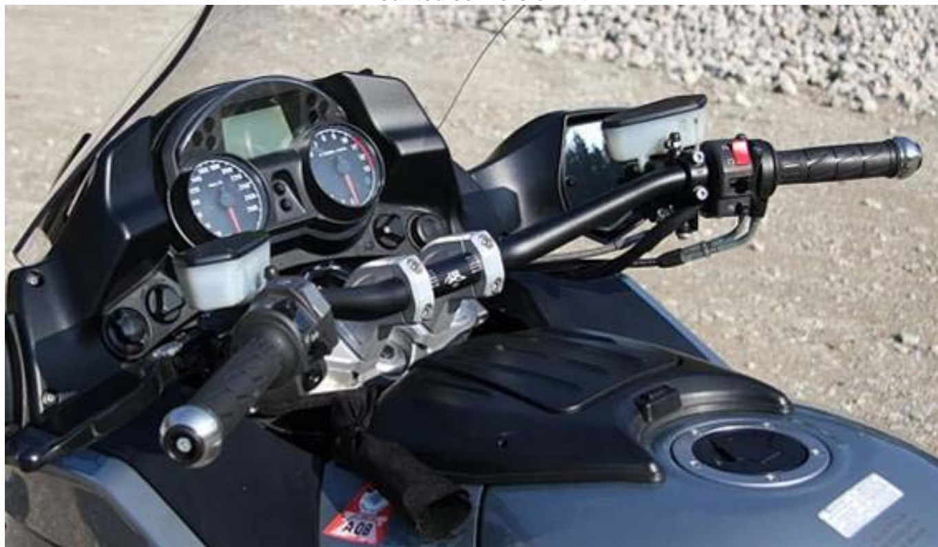
Mounted conversion kit