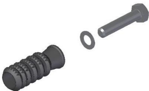
FTR 1200 from model 2019